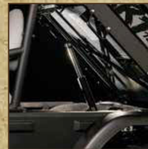
Electric Bed Lift