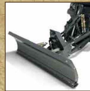
IntelliTach™ 62 in (157 cm) Plow Blade