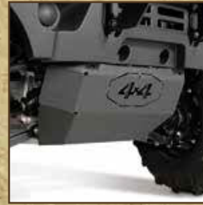
Front Skid Plate