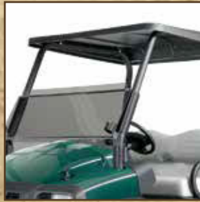
Windshield & Canopy

The XRT1550 is the industry's toughest vehicle, and with hundreds of accessories to choose from, the most versatile, too. Don't see what you need here? Ask your dealer for a complete list.