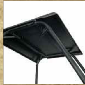
FOPS (Falling Object Protection Structure)