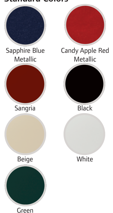
Take Your Seat Choose standard beige or white seats.